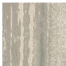
Awaken 38506 LRV 25.6