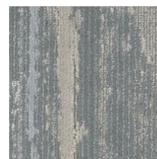
Dwell 38535 LRV 14.3