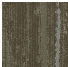
Hike 38751 LRV 8.8