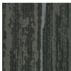
Inspire 38505 LRV 3.2