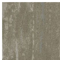
Nest 38760 LRV 13.1