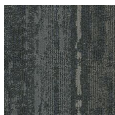
Nurture 38485 LRV 3.4