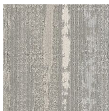
Breeze 38515 LRV 17.9