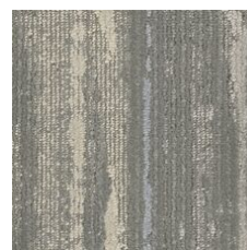
Recharge 38530 LRV 11.9